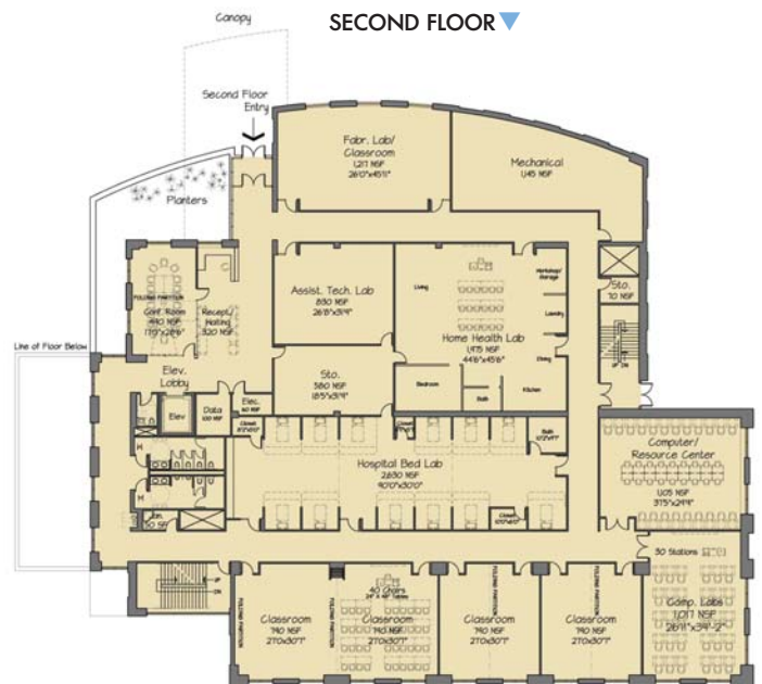
▼ SECOND FLOOR